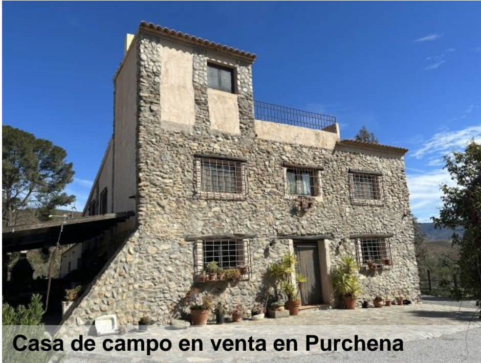
Casa de campo en venta en Purchena